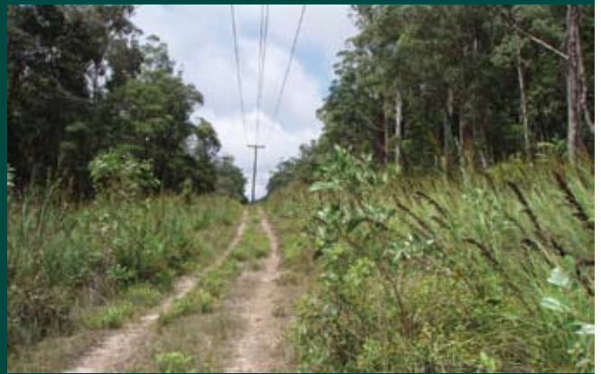
Powerlines, roads, access tracks, and railway lines create barriers to wildlife movement.

Stanwell also retains the vegetation that grows along the banks of rivers and creeks (riparian vegetation) wherever possible along power line corridors and roadways. By preserving riparian and low growing, native vegetation it increases the connectivity between habitats which provides small mammals with a safe passageway across the power line corridors and roadways.