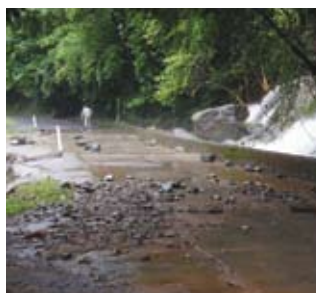
Lake Placid Road, Cairns

With the heavy rainfall, small landslides and road flooding was experienced in North Queensland, which prevented Stanwell employees from attending sites for a number of days due to the road blockages. Barron Gorge Hydro continued to operate but safety concerns for the plant required Kareeya Hydro to be shut down for two days. Both sites have the ability to be operated remotely by our local On Call Officer or our Brisbane Trading Division.