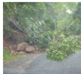
Lake Placid Road, Cairns