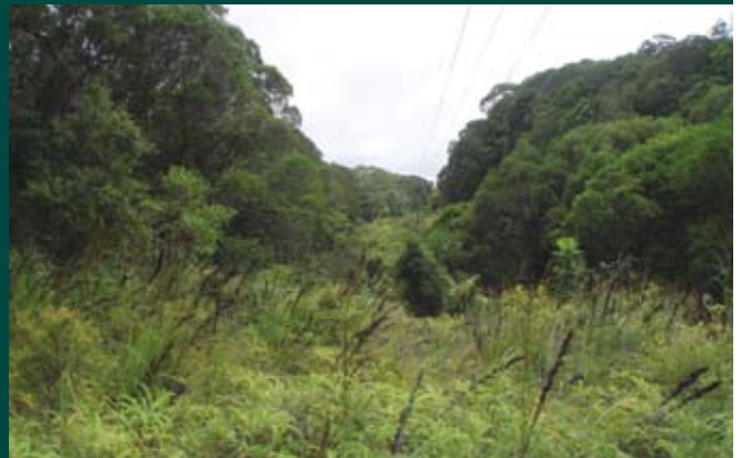
Riparian Vegetation is kept in tact to promote connectivity across powerline corridors

To know more about Stanwell’s environmental initiatives visit www.stanwell.com