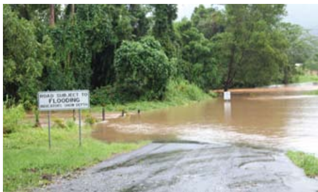
Tully Gorge Road